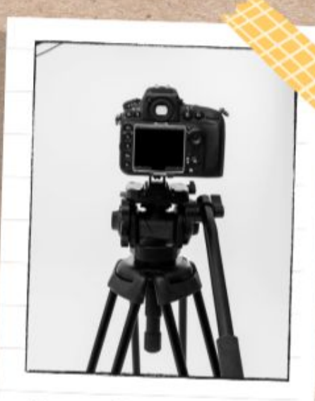
Come Take A Pic

All 5th - 8th graders who are interested in helping create this year's yearbook attend the info meeting